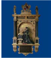
The Henry Smith Charity